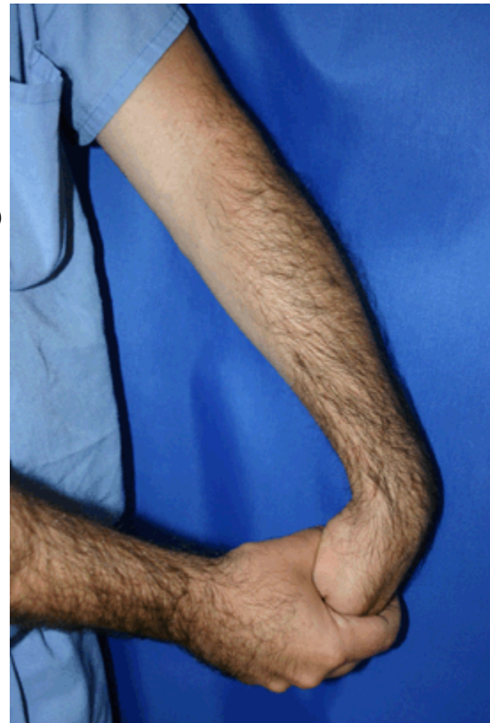
Figure 3 Wrist stretching exercise with elbow extended

After pain is relieved, the next phase of treatment starts. Modifying activities can help make sure that symptoms do not come back. The doctor may want you to do physical therapy. This may include stretching and range of motion exercises and gradual strengthening of the affected muscles and tendons (see Figure 3). Physical therapy can help complete recovery and give you back a painless and normally functioning elbow. Nonoperative treatment is successful in approximately 85 percent to 90 percent of patients with tennis elbow.