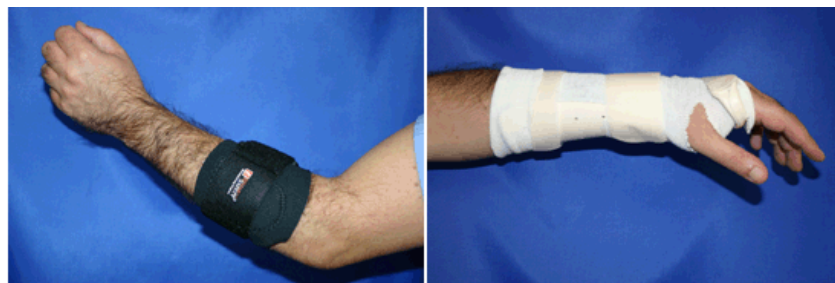
Figure 2 Counterforce brace

Orthotics can help diminish symptoms of tennis elbow. The doctor may want you to use counterforce braces and wrist splints. These can reduce symptoms by resting the muscles and tendons (see Figure 2).